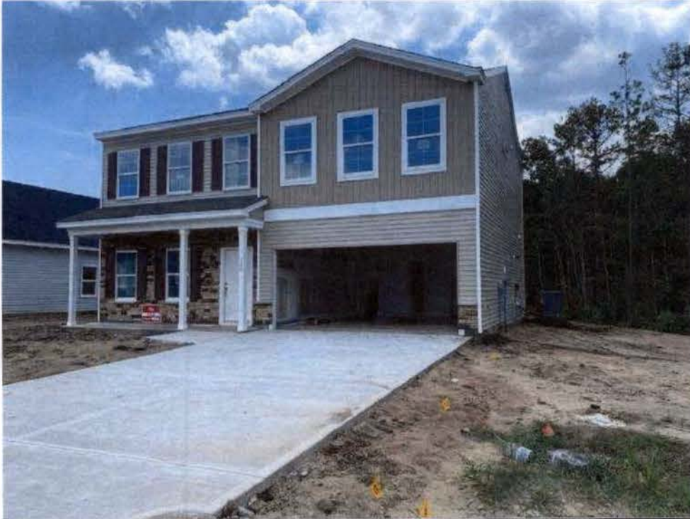
Photo One Caption Front View; 08-08-2022

If using the Elevation Certificate to obtain NFIP flood insurance, affix at least 2 building photographs below according to the instructions for Item A6. Identify all photographs with date taken; "Front View" and "Rear View"; and, if required, "Right Side View" and "Left Side View." When applicable, photographs must show the foundation with representative examples of the flood openings or vents, as indicated in Section A8. If submitting more photographs than will fit on this page, use the Continuation Page.