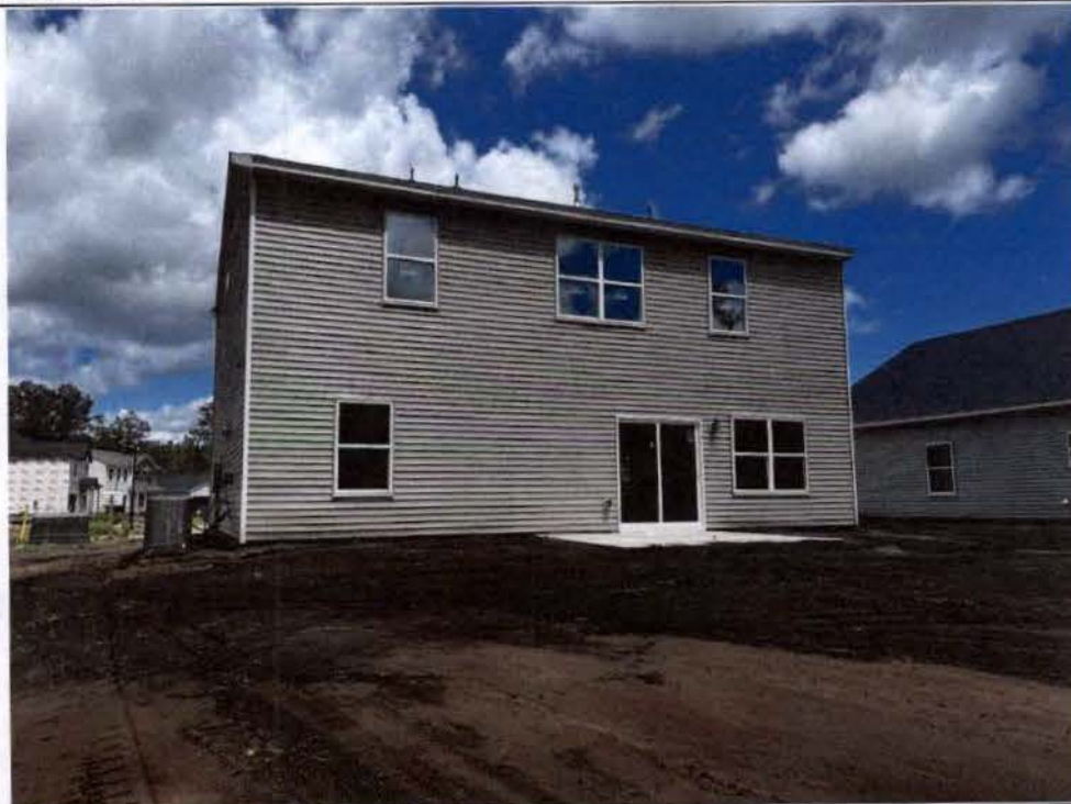
Photo Two Caption Rear View; 08-08-2022