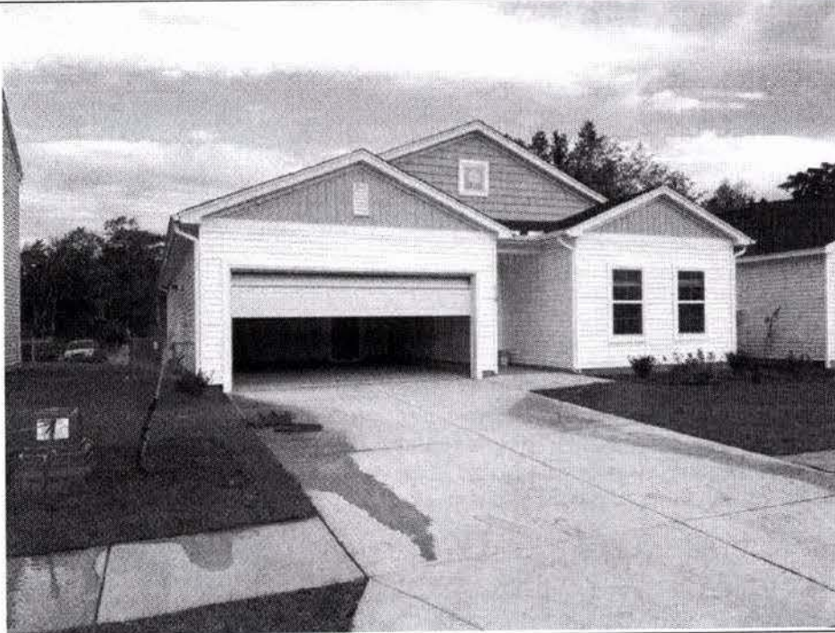
Photo One Caption Front View; 09-28-2022

If using the Elevation Certificate to obtain NFIP flood insurance, affix at least 2 building photographs below according to the instructions for Item A6. Identify all photographs with date taken; "Front View" and "Rear View"; and, if required, "Right Side View" and "Left Side View." When applicable, photographs must show the foundation with representative examples of the flood openings or vents, as indicated in Section A8. If submitting more photographs than will fit on this page, use the Continuation Page.