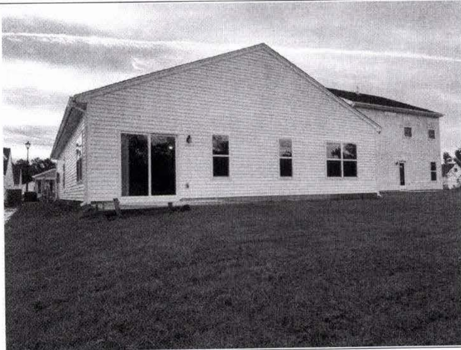
Photo Two Caption Rear View; 09-28-2022