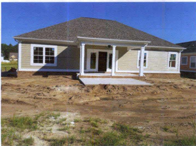
Rear View (07/27/16)