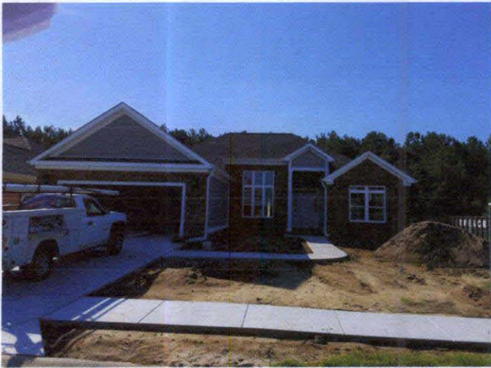
Front View (07/27/16)

If using the Elevation Certificate to obtain NFIP flood insurance, affix at least 2 building photographs below according to the instructions for Item A6. Identify all photographs with date taken; "Front view" and Rear view"; and, if required, "Right Side View" and "Left Side View." When applicable, photographs must show the foundation with representative examples of the flood openings or vents, as indicated in Section A8. If submitting more photographs than will fit on this page, use the Continuation Page.