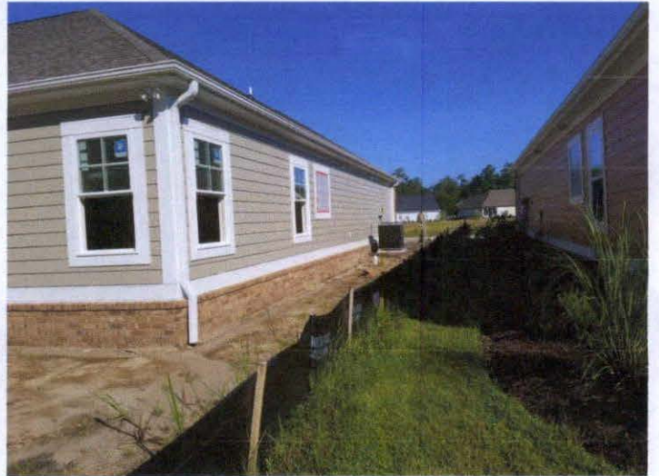
Left View (07/27/16)