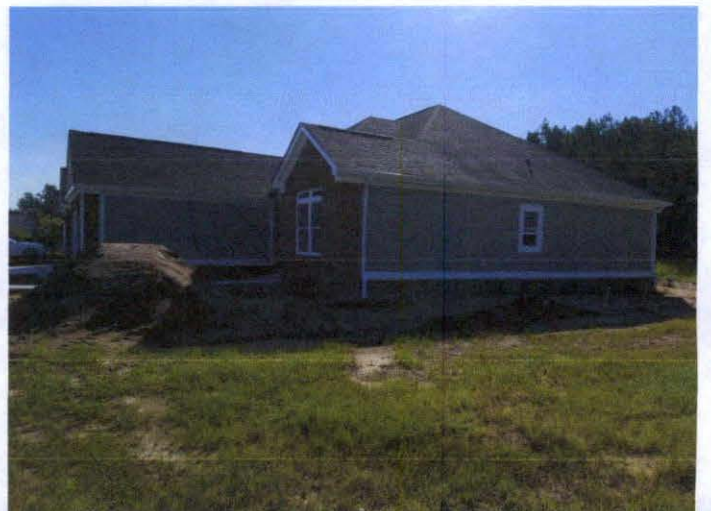
Right View (07/27/16)