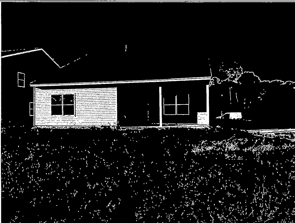
Photo Two Caption Rear View; 10-20-2022