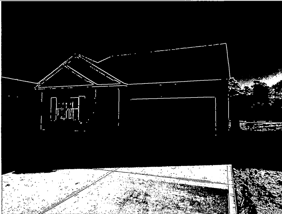
Photo One Caption Front View; 10-20-2022

If using the Elevation Certificate to obtain NFIP flood insurance, affix at least 2 building photographs below according to the instructions for Item A6. Identify all photographs with date taken; "Front View" and "Rear View"; and, if required, "Right Side View" and "Left Side View." When applicable, photographs must show the foundation with representative examples of the flood openings or vents, as indicated in Section A8. If submitting more photographs than will fit on this page, use the Continuation Page.