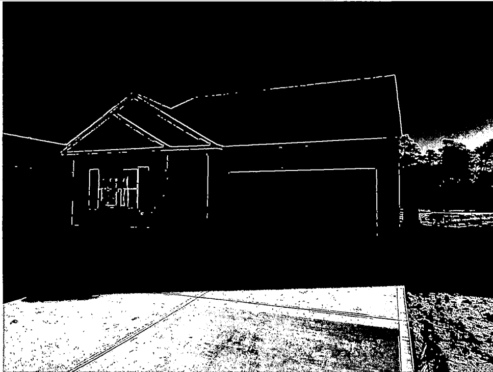
Photo One Caption Front View; 10-20-2022

If using the Elevation Certificate to obtain NFIP flood insurance, affix at least 2 building photographs below according to the instructions for Item A6. Identify all photographs with date taken; "Front View" and "Rear View"; and, if required, "Right Side View" and "Left Side View." When applicable, photographs must show the foundation with representative examples of the flood openings or vents, as indicated in Section A8. If submitting more photographs than will fit on this page, use the Continuation Page.