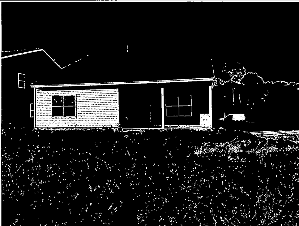
Photo Two Caption Rear View; 10-20-2022