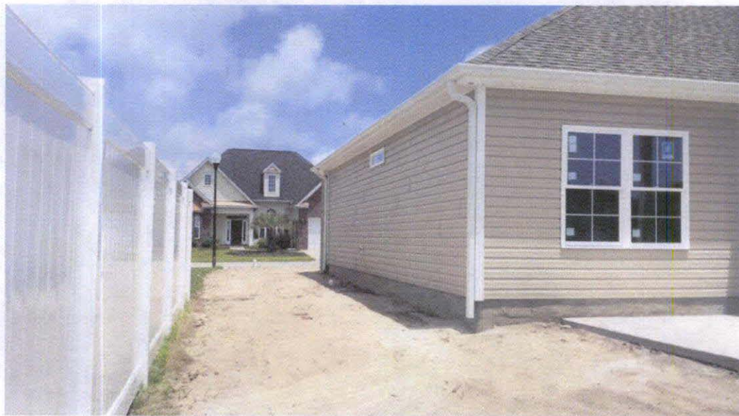
Right-Side View 05/26/15