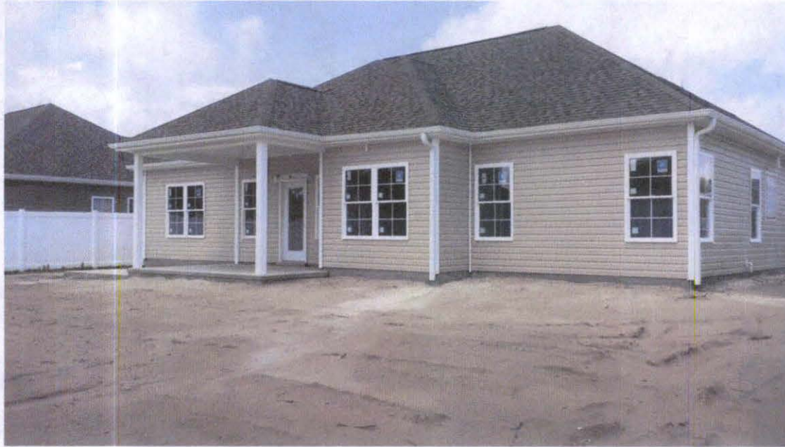
Rear View 05/26/15

If submitting more photographs than will fit on the preceding page, affix the additional photographs below. Identify all photographs with: date taken; "Front View" and "Rear View"; and, if required, "Right Side View" and "Left Side View." When applicable, photographs must show the foundation with representative examples of the flood openings or vents, as indicated in Section A8.