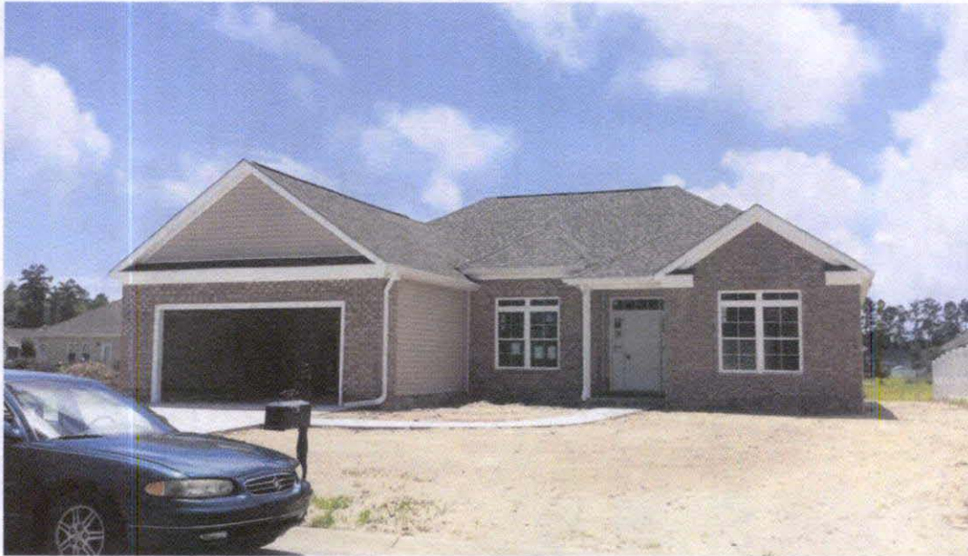
Front View 05/26/15

If using the Elevation Certificate to obtain NFIP flood insurance, affix at least 2 building photographs below according to the instructions for Item A6. Identify all photographs with date taken; "Front View" and "Rear View"; and, if required, "Right Side View" and "Left Side View." When applicable, photographs must show the foundation with representative examples of the flood openings or vents, as indicated in Section A8. If submitting more photographs than will fit on this page, use the Continuation Page.