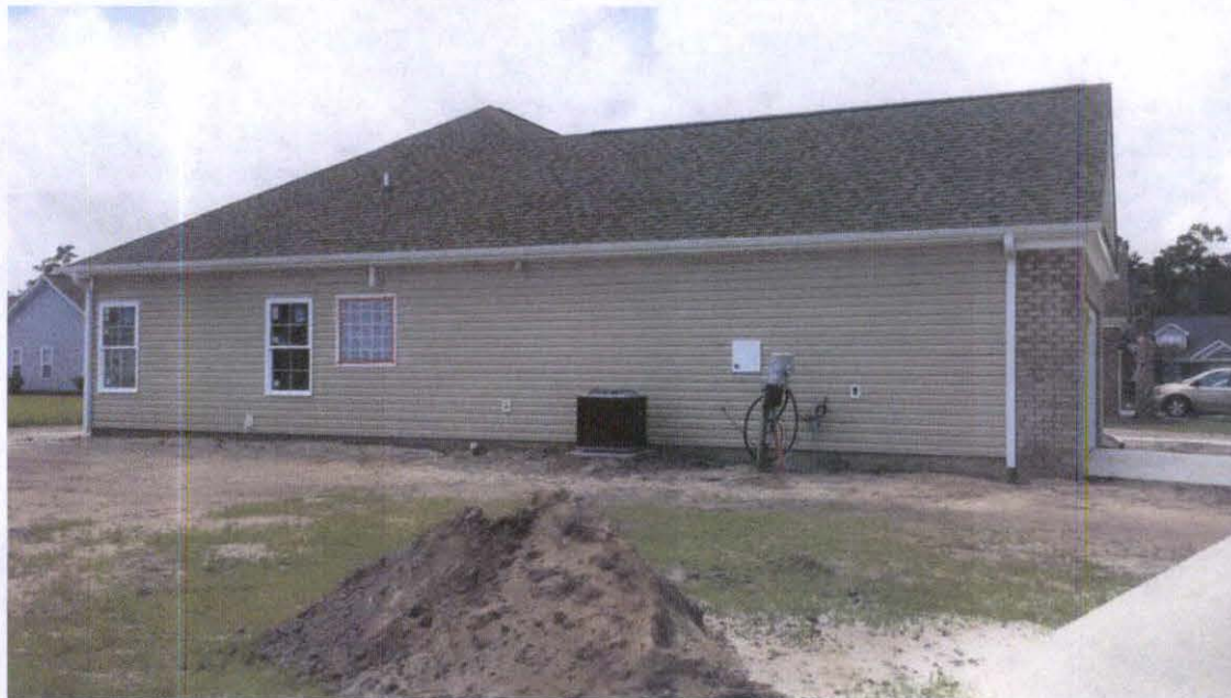
Left-Side View 05/26/15