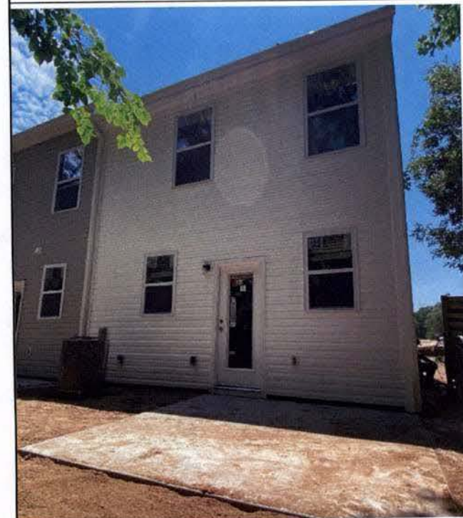
REAR VIEW 07/06/2022