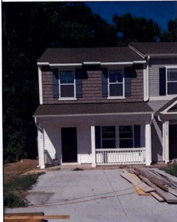
FRONT VIEW 07/06/2022

If using the Elevation Certificate to obtain NFIP flood insurance, affix at least 2 building photographs below according to the instructions for Item A6. Identify all photographs with date taken; "Front View" and "Rear View"; and, if required, "Right Side View" and "Left Side View." When applicable, photographs must show the foundation with representative examples of the flood openings or vents, as indicated in Section A8. If submitting more photographs than will fit on this page, use the Continuation Page.