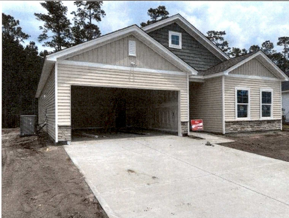
Photo One Caption Front View; 05-23-2023

If using the Elevation Certificate to obtain NFIP flood insurance, affix at least 2 building photographs below according to the instructions for Item A6. Identify all photographs with date taken; "Front View" and "Rear View"; and, if required, "Right Side View" and "Left Side View." When applicable, photographs must show the foundation with representative examples of the flood openings or vents, as indicated in Section A8. If submitting more photographs than will fit on this page, use the Continuation Page.