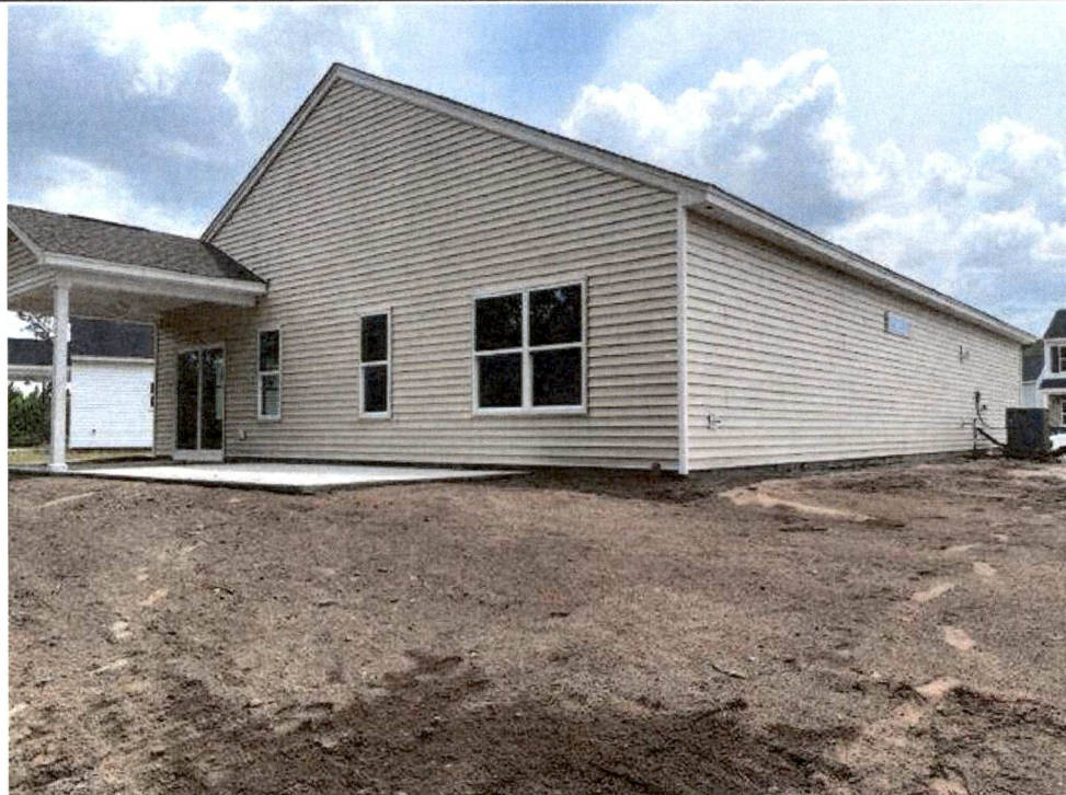
Photo Two Caption Rear View; 05-23-2023