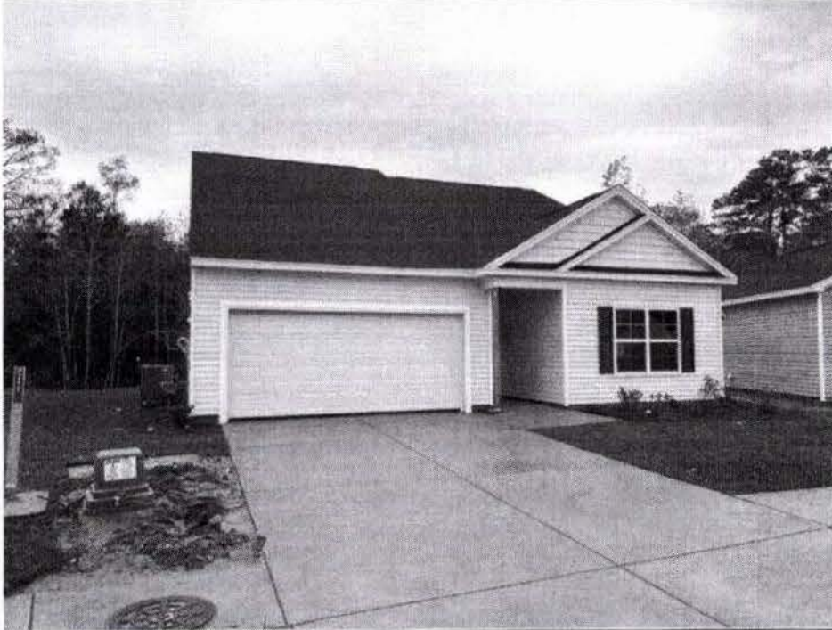
Photo One Caption Front View; 11-23-2022

If using the Elevation Certificate to obtain NFIP flood insurance, affix at least 2 building photographs below according to the instructions for Item A6. Identify all photographs with date taken; "Front View" and "Rear View"; and, if required, "Right Side View" and "Left Side View." When applicable, photographs must show the foundation with representative examples of the flood openings or vents, as indicated in Section A8. If submitting more photographs than will fit on this page, use the Continuation Page.