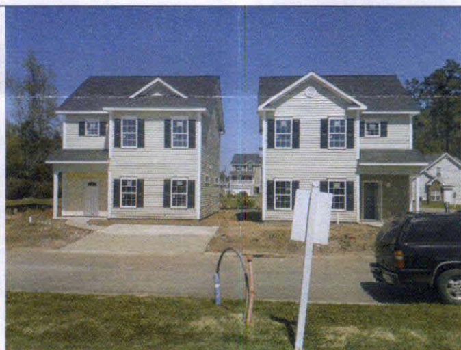
FRONT VIEW (UNIT 19 ON RIGHT)

If using the Elevation Certificate to obtain NFIP flood insurance, affix at least 2 building photographs below according to the instructions for Item A6. Identify all photographs with date taken; "Front View" and "Rear View"; and, if required, "Right Side View" and "Left Side View." When applicable, photographs must show the foundation with representative examples of the flood openings or vents, as indicated in Section A8. If submitting more photographs than will fit on this page, use the Continuation Page.