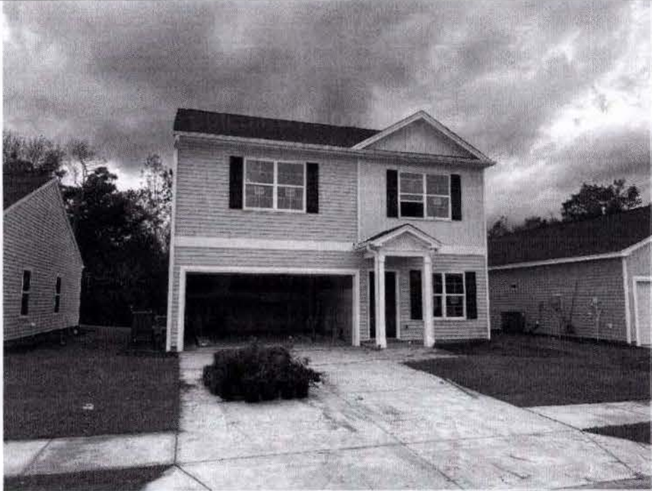
Photo One Caption Front View; 10-26-2022

If using the Elevation Certificate to obtain NFIP flood insurance, affix at least 2 building photographs below according to the instructions for Item A6. Identify all photographs with date taken; "Front View" and "Rear View"; and, if required, "Right Side View" and "Left Side View." When applicable, photographs must show the foundation with representative examples of the flood openings or vents, as indicated in Section A8. If submitting more photographs than will fit on this page, use the Continuation Page.