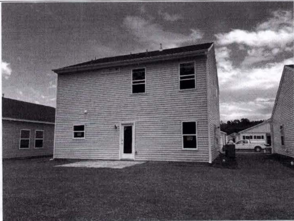
Photo Two Caption Rear View; 10-26-2022