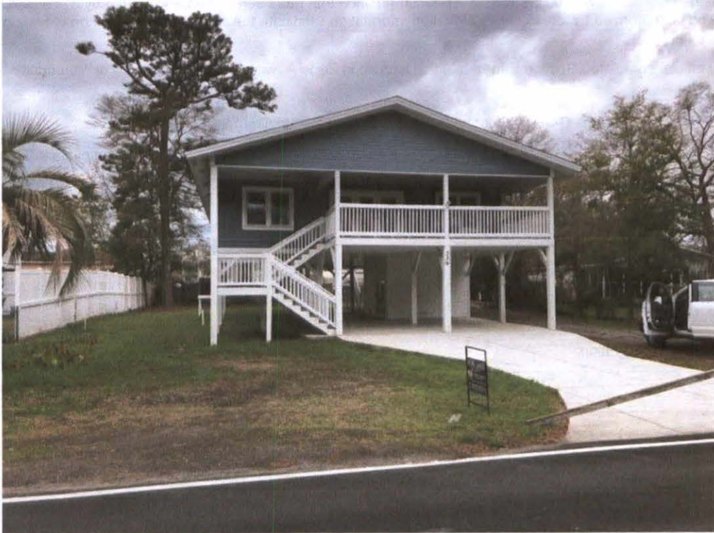
Front View March 21, 2018

If using the Elevation Certificate to obtain NFIP flood insurance, affix at least 2 building photographs below according to the instructions for Item A6. Identify all photographs with date taken; "Front view" and "Rear view"; and, if required, "Right Side View" and "Left Side View." When applicable, photographs must show the foundation with representative examples of the flood openings or vents, as indicated in Section A8. If submitting more photographs than will fit on this page, use the Continuation Page.