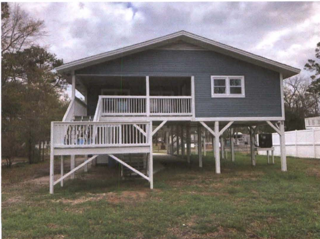
Rear View March 21, 2018