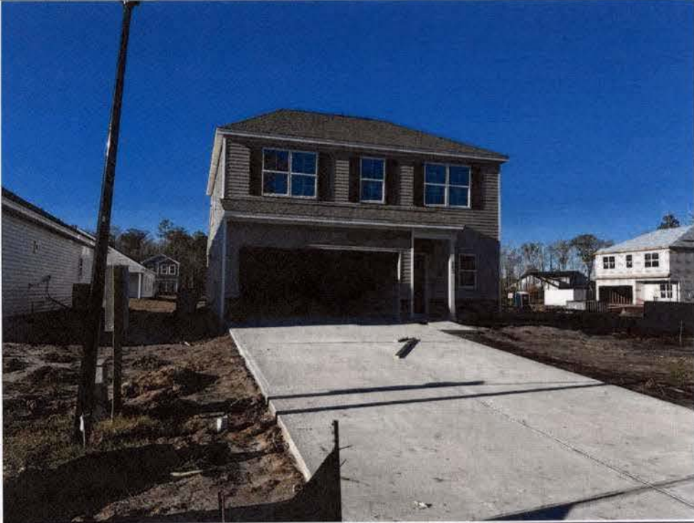
Photo One Caption Front View; 11-28-2022

If using the Elevation Certificate to obtain NFIP flood insurance, affix at least 2 building photographs below according to the instructions for Item A6. Identify all photographs with date taken; "Front View" and "Rear View"; and, if required, "Right Side View" and "Left Side View." When applicable, photographs must show the foundation with representative examples of the flood openings or vents, as indicated in Section A8. If submitting more photographs than will fit on this page, use the Continuation Page.