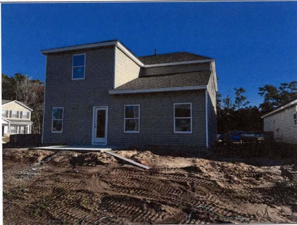
Photo Two Caption Rear View; 11-28-2022