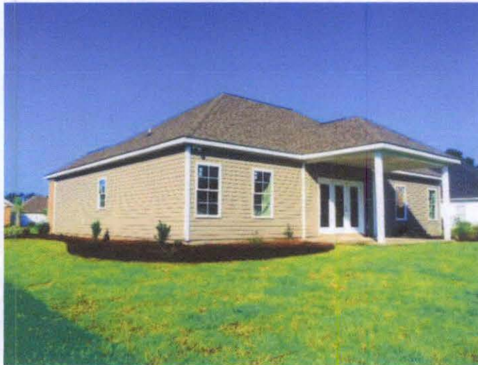
Right Side View 09/01/15