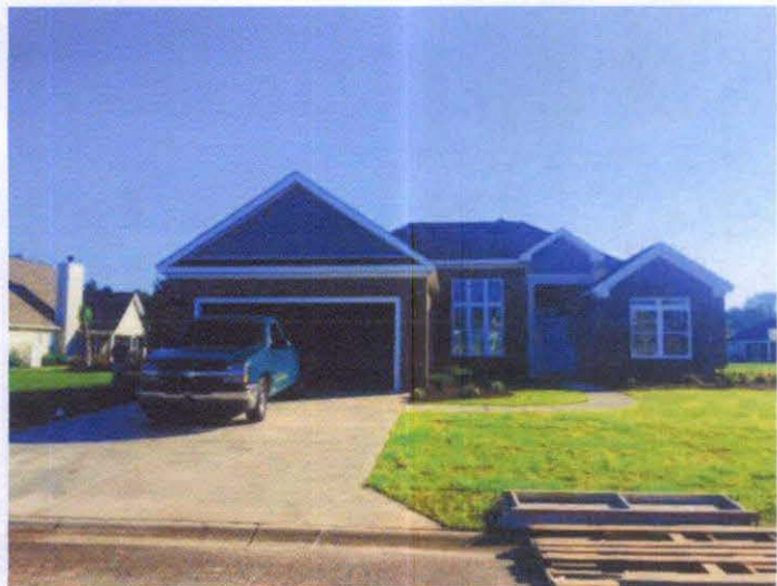
Front View 09/01/15

If using the Elevation Certificate to obtain NFIP flood insurance, affix at least 2 building photographs below according to the instructions for Item A6. Identify all photographs with date taken; "Front View" and "Rear View"; and, if required, "Right Side View" and "Left Side View." When applicable, photographs must show the foundation with representative examples of the flood openings or vents, as indicated in Section A8. If submitting more photographs than will fit on this page, use the Continuation Page.