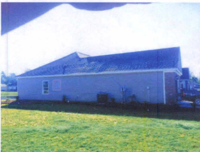
Left Side View 09/01/15