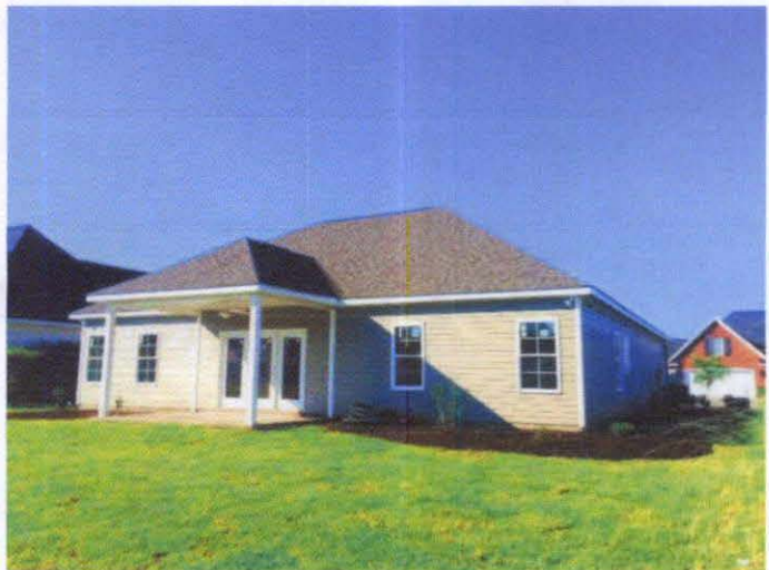
Rear View 09/01/15