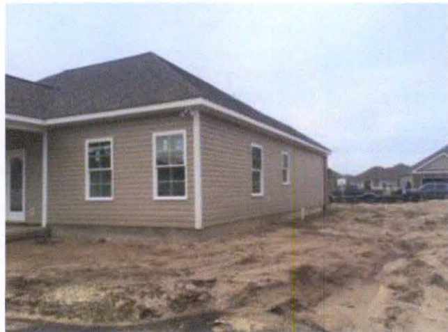
Left Side View (01-06-16)