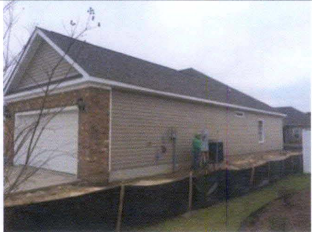
Right Side View (01-06-16)