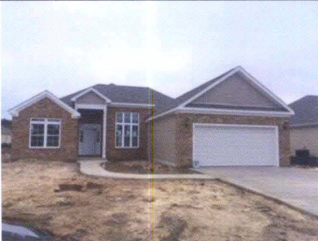
Front View (01-06-16)

If using the Elevation Certificate to obtain NFIP flood insurance, affix at least 2 building photographs below according to the instructions for Item A6. Identify all photographs with date taken; "Front View" and "Rear View"; and, if required, "Right Side View" and "Left Side View." When applicable, photographs must show the foundation with representative examples of the flood openings or vents, as indicated in Section A8. If submitting more photographs than will fit on this page, use the Continuation Page.