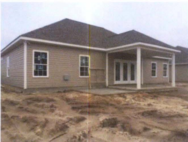
Rear View (01-06-16)