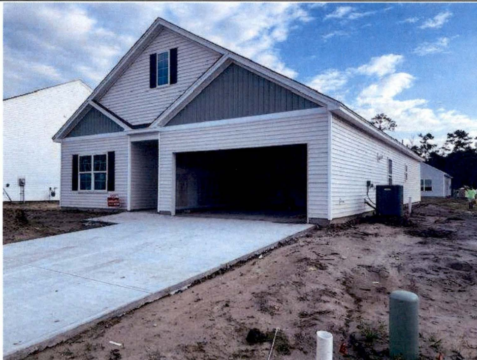
Photo One Caption Front View; 10-11-2022

If using the Elevation Certificate to obtain NFIP flood insurance, affix at least 2 building photographs below according to the instructions for Item A6. Identify all photographs with date taken; "Front View" and "Rear View"; and, if required, "Right Side View" and "Left Side View." When applicable, photographs must show the foundation with representative examples of the flood openings or vents, as indicated in Section A8. If submitting more photographs than will fit on this page, use the Continuation Page.