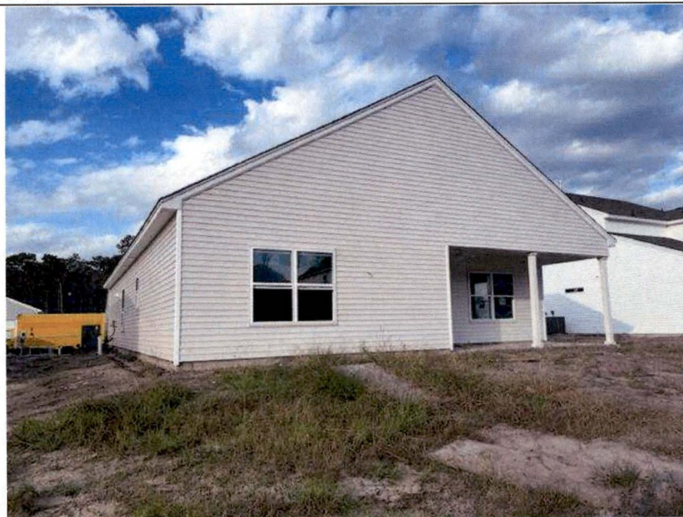
Photo Two Caption Rear View; 10-11-2022