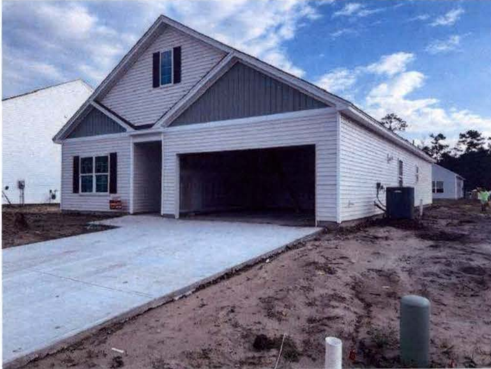
Photo One Caption Front View; 10-11-2022

If using the Elevation Certificate to obtain NFIP flood insurance, affix at least 2 building photographs below according to the instructions for Item A6. Identify all photographs with date taken; "Front View" and "Rear View"; and, if required, "Right Side View" and "Left Side View." When applicable, photographs must show the foundation with representative examples of the flood openings or vents, as indicated in Section A8. If submitting more photographs than will fit on this page, use the Continuation Page.