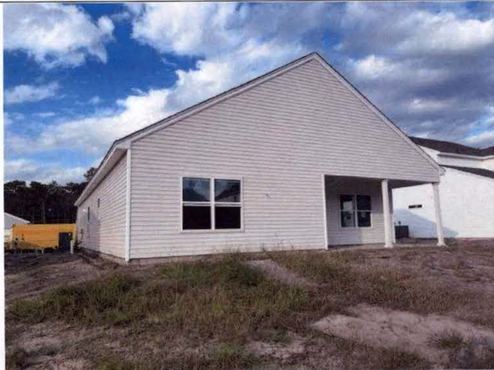
Photo Two Caption Rear View; 10-11-2022