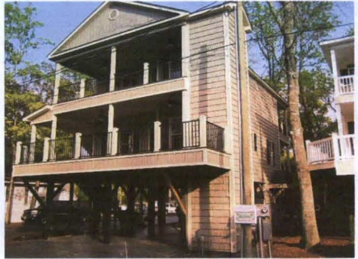
Front/Right Side View (4-14-15)