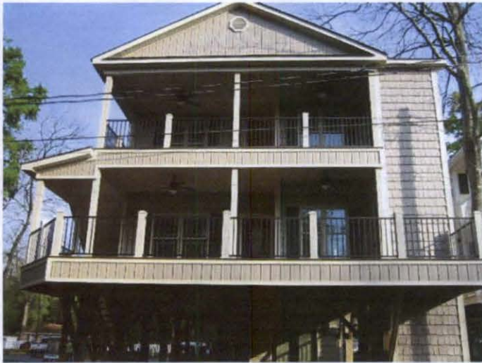
Front View (4-14-15)

If using the Elevation Certificate to obtain NFIP flood insurance, affix at least 2 building photographs below according to the instructions for Item A6. Identify all photographs with date taken; "Front View" and "Rear View"; and, if required, "Right Side View" and "Left Side View." When applicable, photographs must show the foundation with representative examples of the flood openings or vents, as indicated in Section A8. If submitting more photographs than will fit on this page, use the Continuation Page.