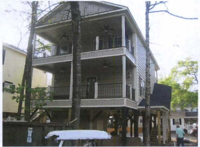
Rear View (4-14-15)