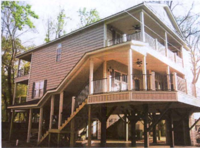
Left Side View (4-14-15)