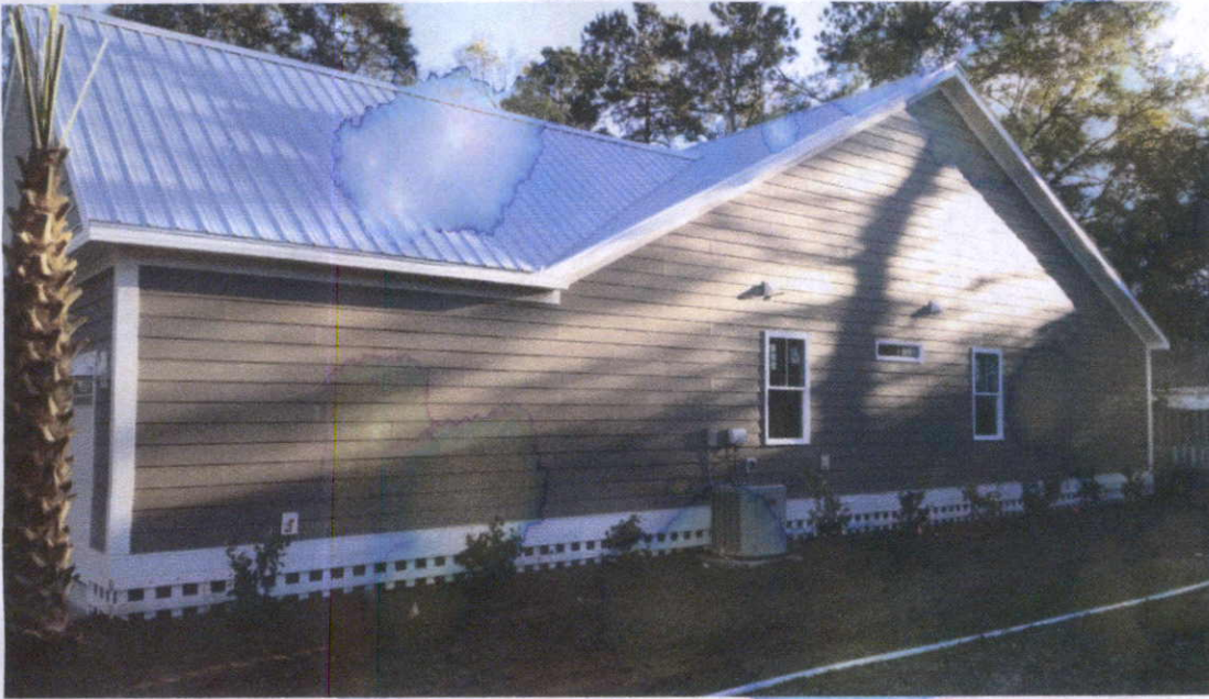
Right / AC 1/12/16

If submitting more photographs than will fit on the preceding page, affix the additional photographs below. Identify all photographs with: date taken; "Front View" and "Rear View"; and, if required, "Right Side View" and "Left Side View." When applicable, photographs must show the foundation with representative examples of the flood openings or vents, as indicated in Section A8.