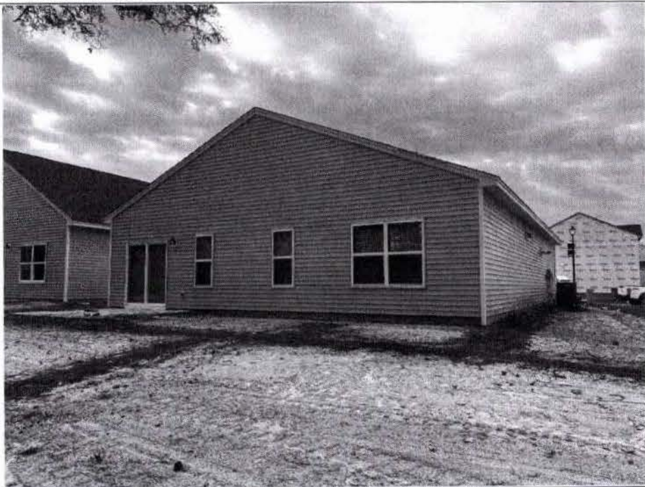
Photo Two Caption Rear View; 11-22-2022 Clear Photo Two