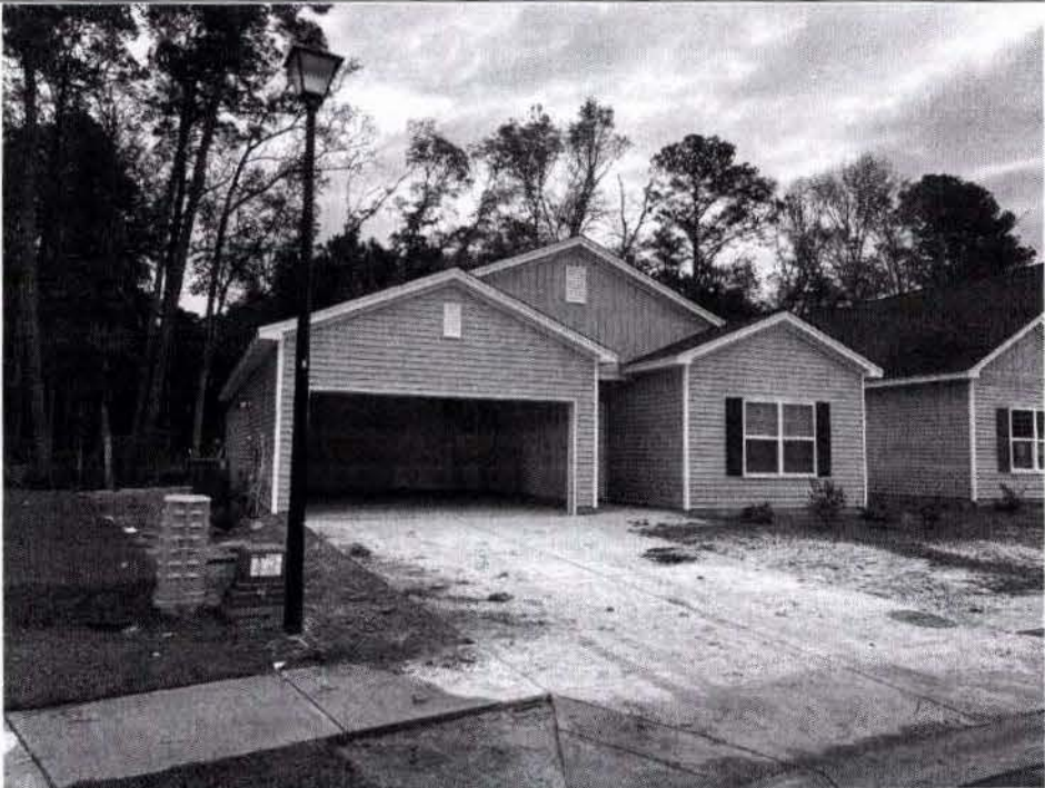
Photo One Caption Front View; 11-22-2022 Clear Photo One

If using the Elevation Certificate to obtain NFIP flood insurance, affix at least 2 building photographs below according to the instructions for Item A6. Identify all photographs with date taken; "Front View" and "Rear View"; and, if required, "Right Side View" and "Left Side View." When applicable, photographs must show the foundation with representative examples of the flood openings or vents, as indicated in Section A8. If submitting more photographs than will fit on this page, use the Continuation Page.