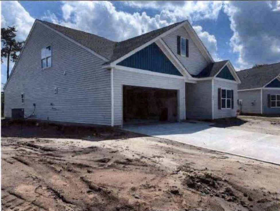
Photo One Caption Front View; 09-14-2022

If using the Elevation Certificate to obtain NFIP flood insurance, affix at least 2 building photographs below according to the instructions for Item A6. Identify all photographs with date taken; "Front View" and "Rear View"; and, if required, "Right Side View" and "Left Side View." When applicable, photographs must show the foundation with representative examples of the flood openings or vents, as indicated in Section A8. If submitting more photographs than will fit on this page, use the Continuation Page.