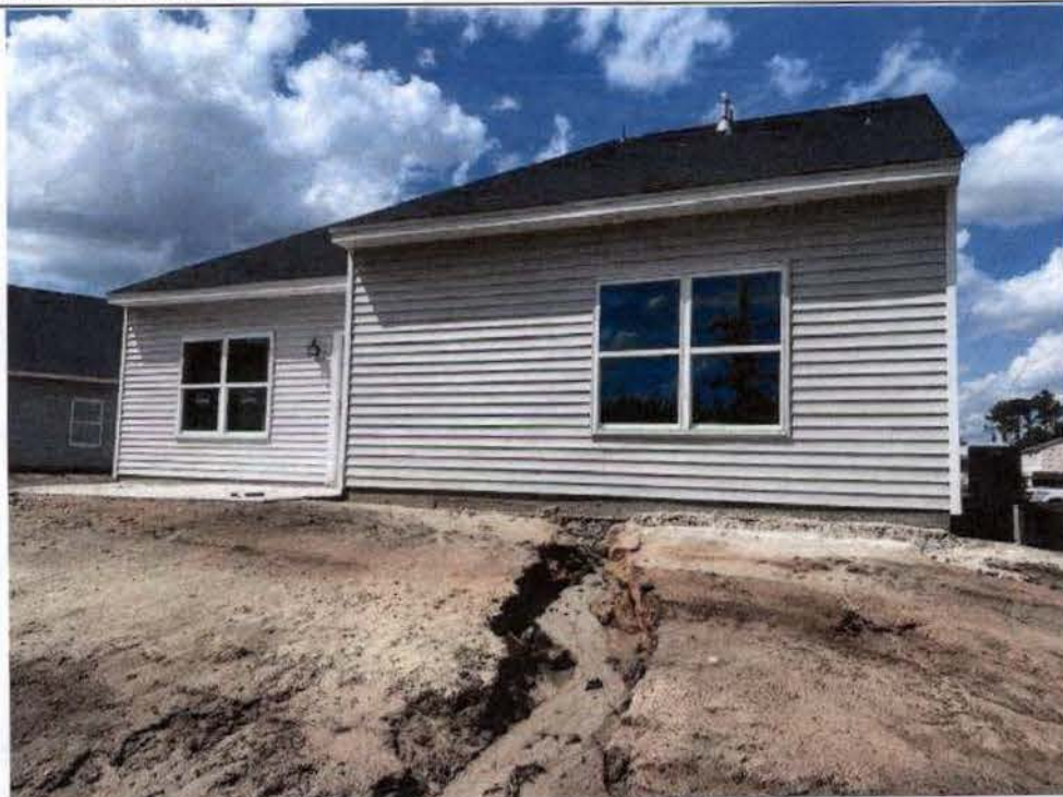
Photo Two Caption Rear View; 09-14-2022