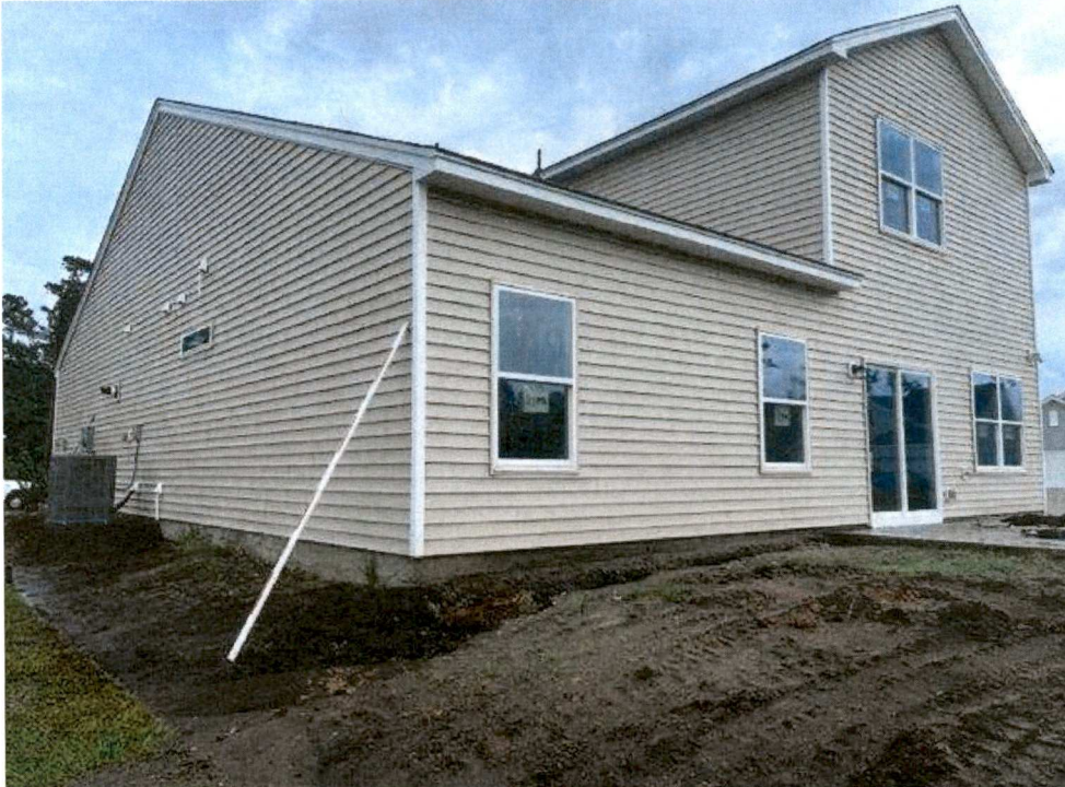
Photo Two Caption Right-Rear View; 06-22-2023