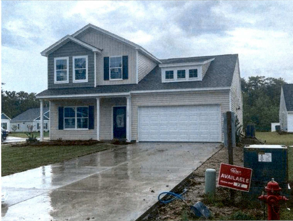
Photo One Caption Front View; 06-22-2023

If using the Elevation Certificate to obtain NFIP flood insurance, affix at least 2 building photographs below according to the instructions for Item A6. Identify all photographs with date taken; "Front View" and "Rear View"; and, if required, "Right Side View" and "Left Side View." When applicable, photographs must show the foundation with representative examples of the flood openings or vents, as indicated in Section A8. If submitting more photographs than will fit on this page, use the Continuation Page.