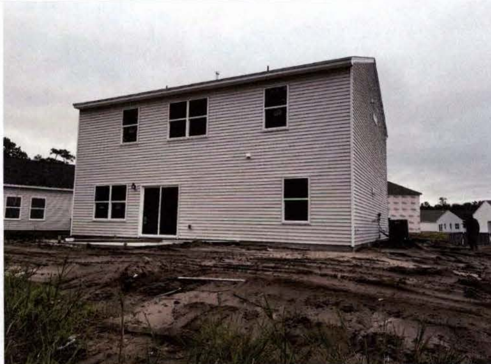
Photo Two Caption Rear View; 10-03-2022