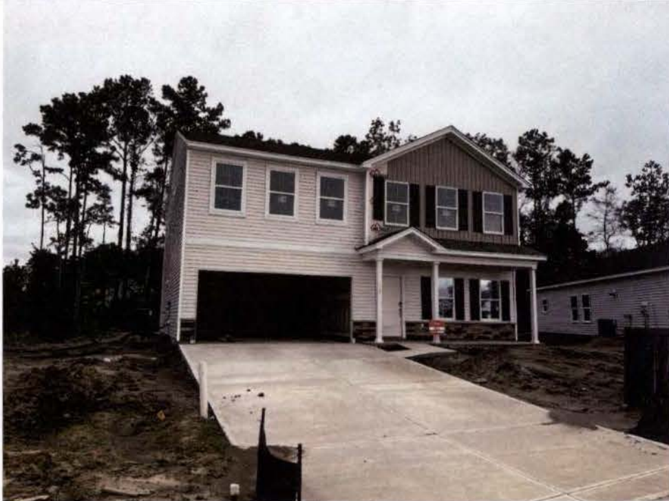
Photo One Caption Front View; 10-03-2022

If using the Elevation Certificate to obtain NFIP flood insurance, affix at least 2 building photographs below according to the instructions for Item A6. Identify all photographs with date taken; "Front View" and "Rear View"; and, if required, "Right Side View" and "Left Side View." When applicable, photographs must show the foundation with representative examples of the flood openings or vents, as indicated in Section A8. If submitting more photographs than will fit on this page, use the Continuation Page.