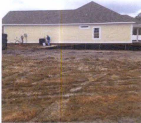
Right Side View (03-04-16)

If using the Elevation Certificate to obtain NFIP flood insurance, affix at least 2 building photographs below according to the instructions for Item A6. Identify all photographs with date taken; "Front View" and "Rear View"; and, if required, "Right Side View" and "Left Side View." When applicable, photographs must show the foundation with representative examples of the flood openings or vents, as indicated in Section A8. If submitting more photographs than will fit on this page, use the Continuation Page.