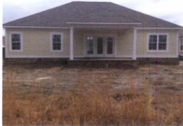
Rear View (03-04-16)