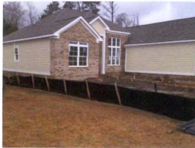
Front & Left View (03-04-16)