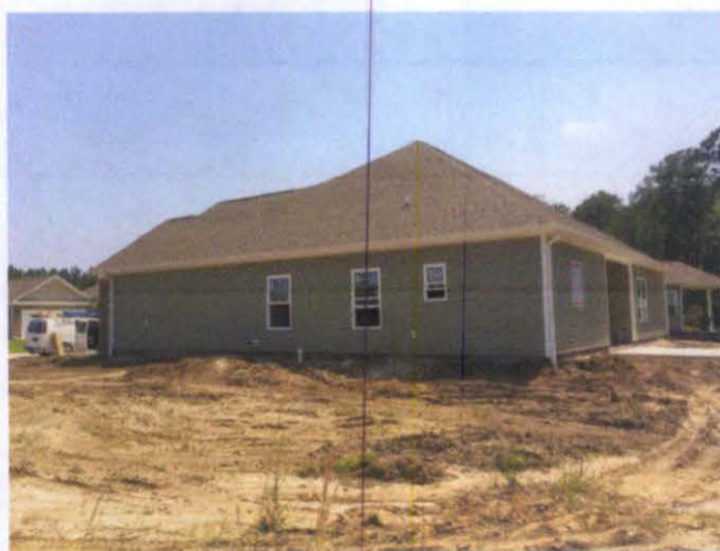
Right View (06/14/16)