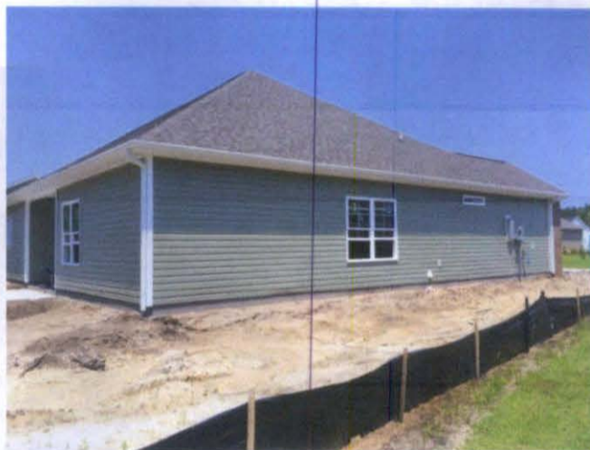
Left View (06/14/16)