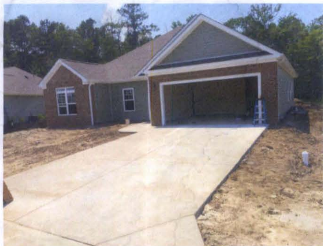
Front View (06/14/16)

If using the Elevation Certificate to obtain NFIP flood insurance, affix at least 2 building photographs below according to the instructions for Item A6. Identify all photographs with date taken; "Front view" and "Rear view"; and, if required, "Right Side View" and "Left Side View." When applicable, photographs must show the foundation with representative examples of the flood openings or vents, as indicated in Section A8. If submitting more photographs than will fit on this page, use the Continuation Page.