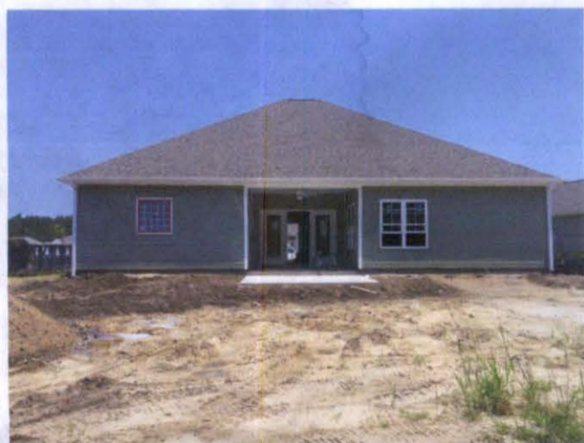
Rear View (06/14/16)