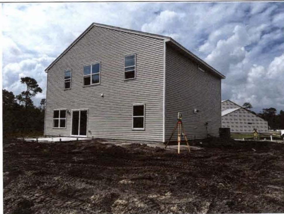
Photo Two Caption Rear View; 08-24-2022