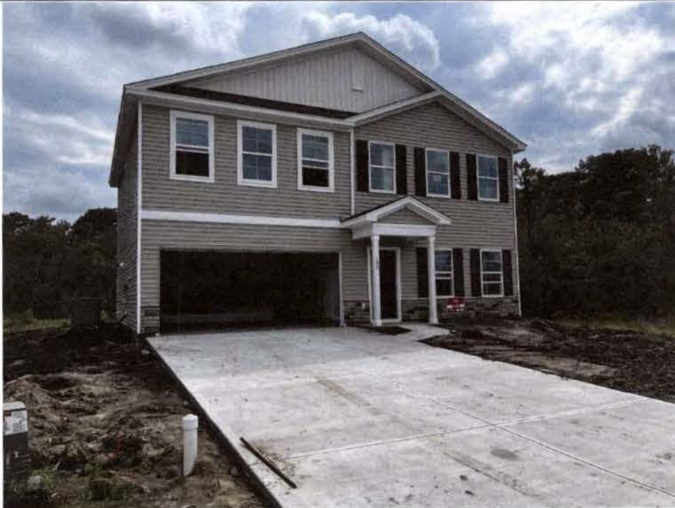
Photo One Caption Front View; 08-24-2022

If using the Elevation Certificate to obtain NFIP flood insurance, affix at least 2 building photographs below according to the instructions for Item A6. Identify all photographs with date taken; "Front View" and "Rear View"; and, if required, "Right Side View" and "Left Side View." When applicable, photographs must show the foundation with representative examples of the flood openings or vents, as indicated in Section A8. If submitting more photographs than will fit on this page, use the Continuation Page.