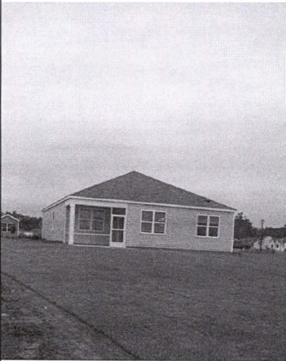
REAR RIGHT VIEW 12/20/2022

If submitting more photographs than will fit on the preceding page, affix the additional photographs below. Identify all photographs with: date taken; "Front View" and "Rear View"; and, if required, "Right Side View" and "Left Side View." When applicable, photographs must show the foundation with representative examples of the flood openings or vents, as indicated in Section A8.