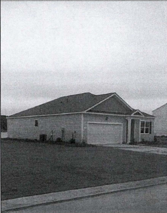
FRONT LEFT VIEW 12/20/2022

If using the Elevation Certificate to obtain NFIP flood insurance, affix at least 2 building photographs below according to the instructions for Item A6. Identify all photographs with date taken; "Front View" and "Rear View"; and, if required, "Right Side View" and "Left Side View." When applicable, photographs must show the foundation with representative examples of the flood openings or vents, as indicated in Section A8. If submitting more photographs than will fit on this page, use the Continuation Page.