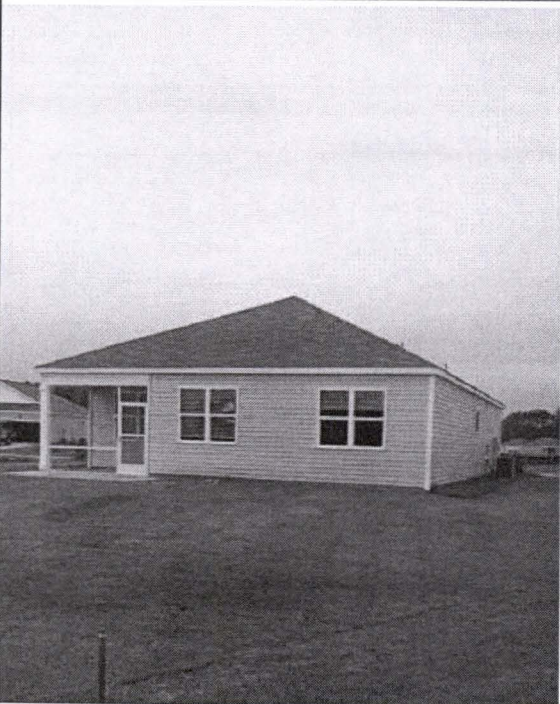
REAR LEFT VIEW 12/20/2022