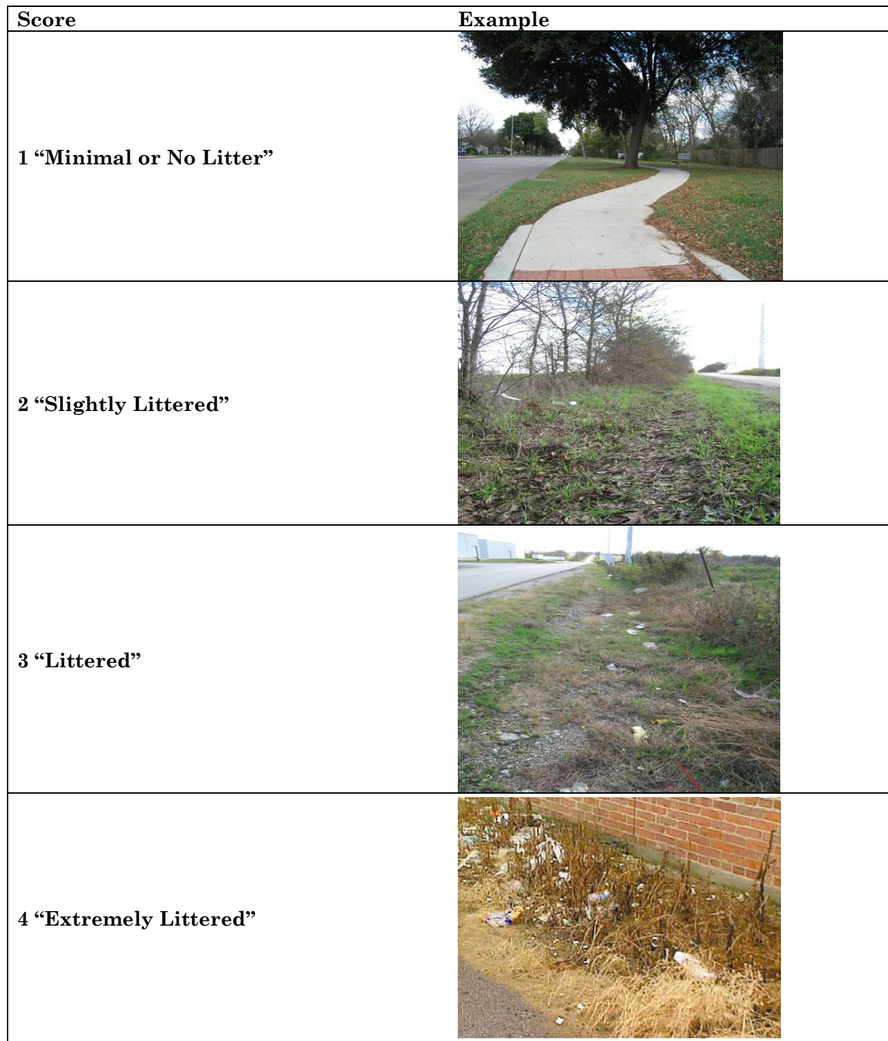
Exhibit 5: Litter Scale: Photographs