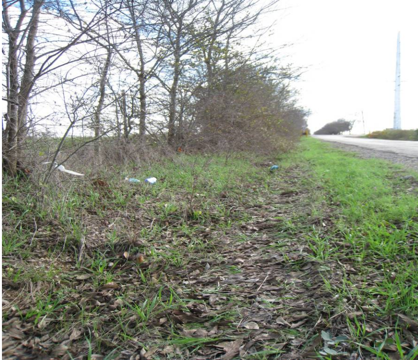
2 “Slightly Littered”