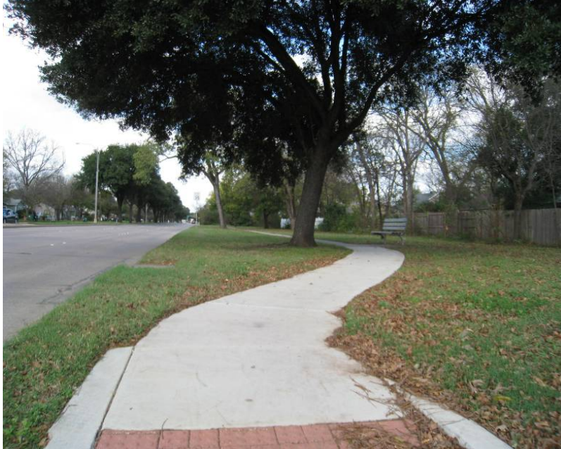
1 “Minimal No Litter”